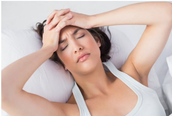
Patients usually experience rapid relief of their symptoms using QuickSplint in combination with Migracises jaw exercises.